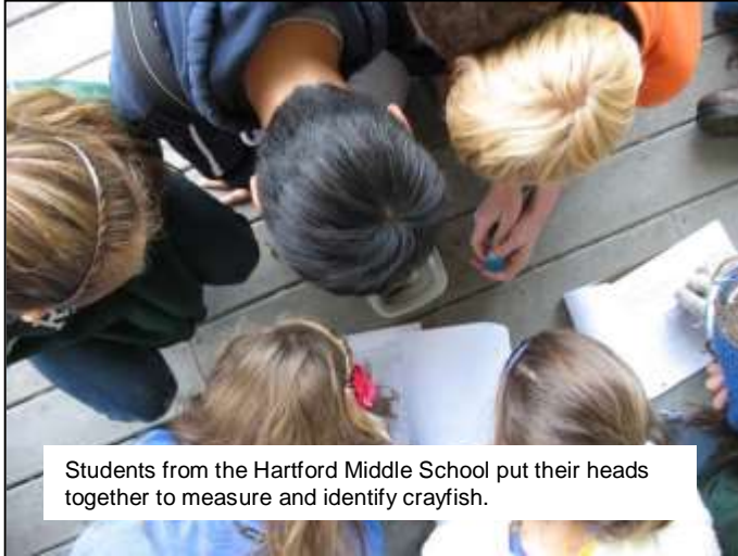
Students from the Hartford Middle School put their heads together to measure and identify crayfish.