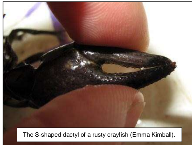
The S-shaped dactyl of a rusty crayfish (Emma Kimball).

Other equipment available to teachers includes WRP water quality equipment (turbidity tubes and conductivity pens), VINS Trout in the Classroom and Water Quality kits, and the Vermont Department of Fish & Wildlife's Furbearer's Kit . Please contact us for more information!