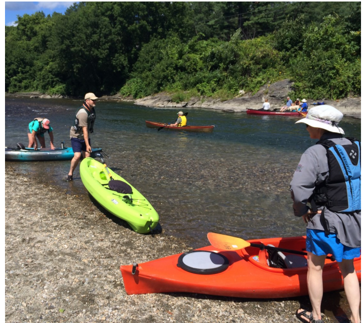
The White River is a popular recreational destination.